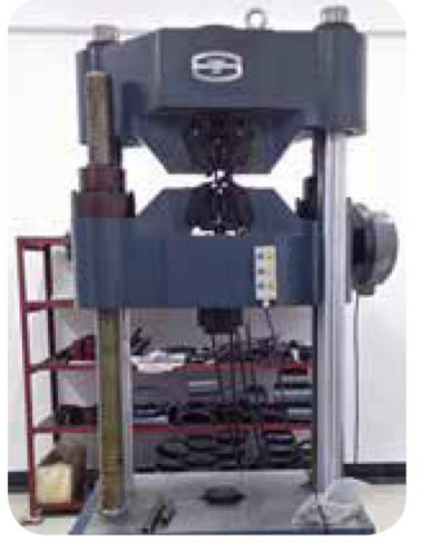
Tensile Strength Testing Machine