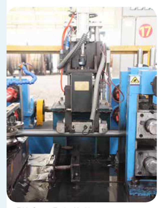
Eddy Current Testing Machine

Inspection facilities include: Spectral Analysis Machine, Metallographic Testing Machine, Universal Material Testing Machine, Eddy Current testing Machine, Hydraulic Testing Machine, Impact Testing Machine, etc.