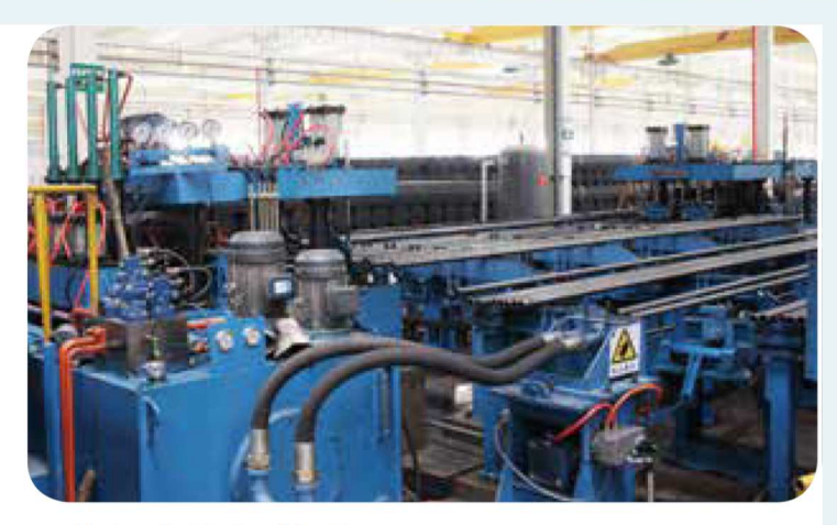
Hydraulic Testing Machine