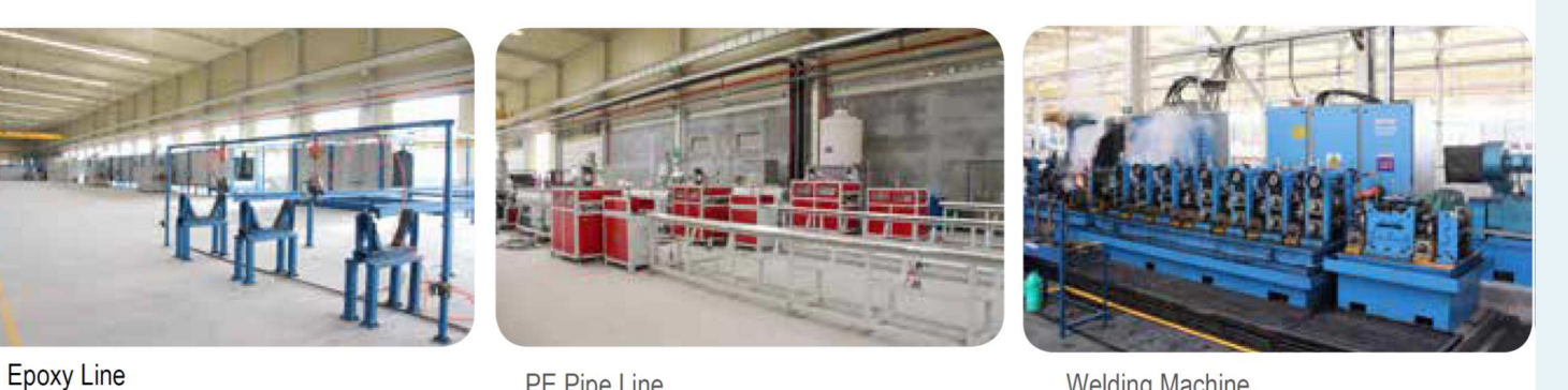
PE Pipe Line